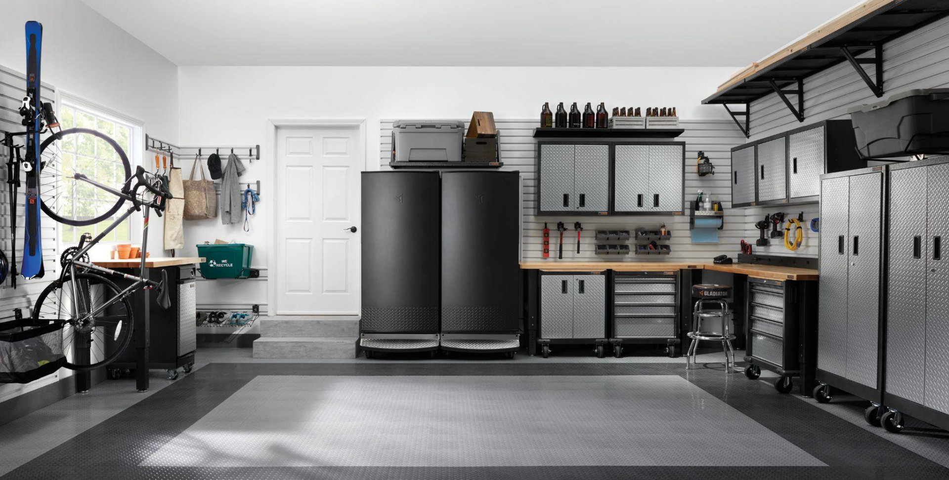
Image represents inspirational solutions that may include additional products and quantities.