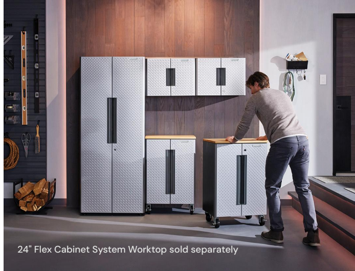
24" Flex Cabinet System Worktop sold separately

Wall cabinet can hang on GearWall® Panels, GearTrack® Channels or directly to the wall via included bracket.