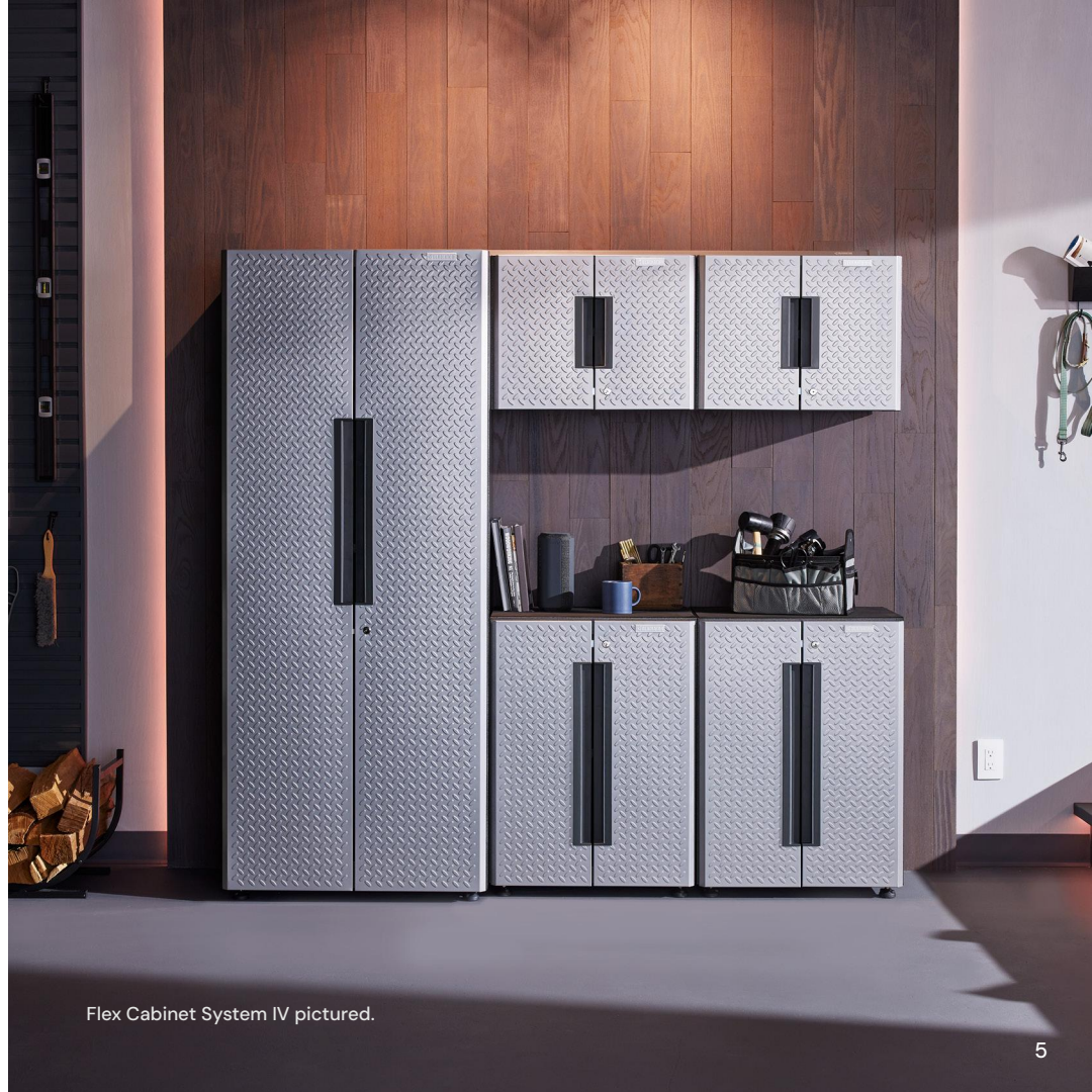
Flex Cabinet System IV pictured.

Wall cabinet can hang on GearWall® Panels, GearTrack® Channels or directly to the wall via included bracket.