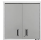
Premier Pre-Assembled 30" Wall GearBox (Qty 2)