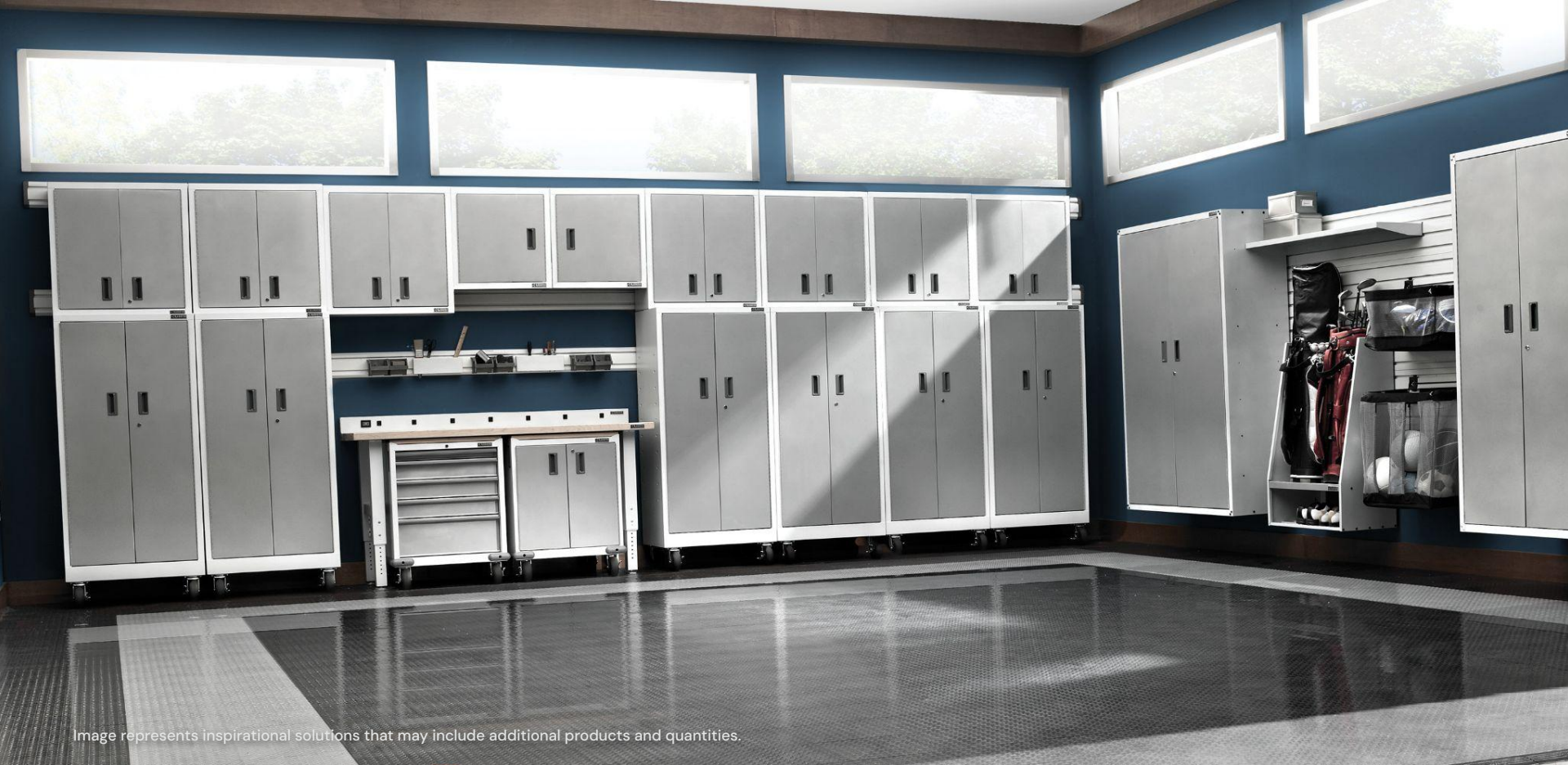
Image represents inspirational solutions that may include additional products and quantities.