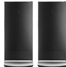
17.8 Cu. Ft. All Refrigerator (Qty 1) 17.8 Cu. Ft. Upright Freezer (Qty 1)