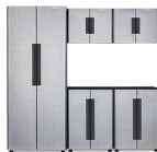
Gladiator® Flex Cabinet System IV (Qty 1) GANF05WFMTS