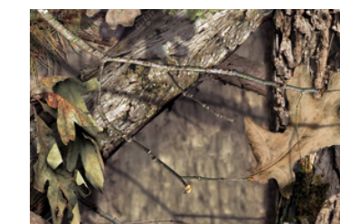
Mossy Oak Shadow Grass Habitat