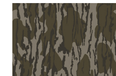
Mossy Oak Original Bottomland

*Mossy Oak is a trademark used under license from Haas Outdoors, Inc. by Kohler.